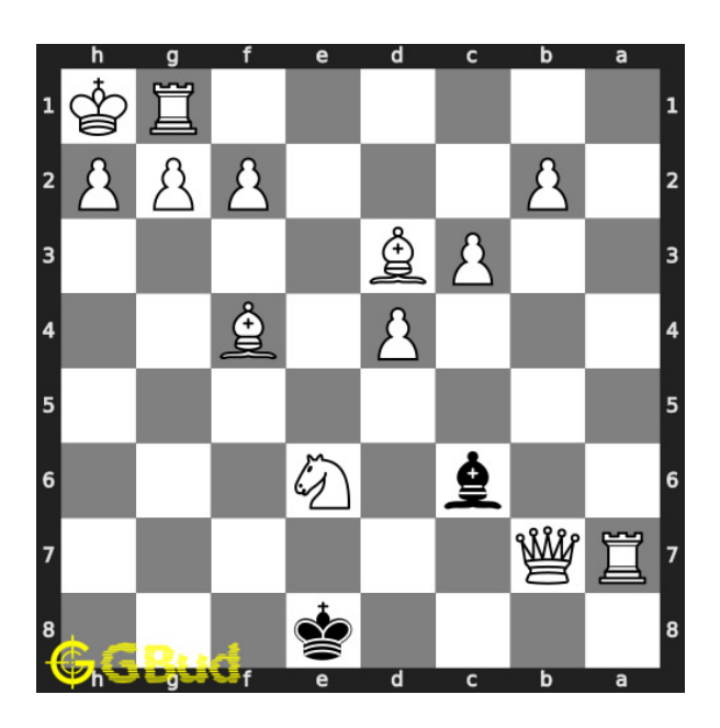
Figure 3: Initial board position of easy chess puzzle 0043

Initial board position This is the initial board position of easy chess puzzle 0043.