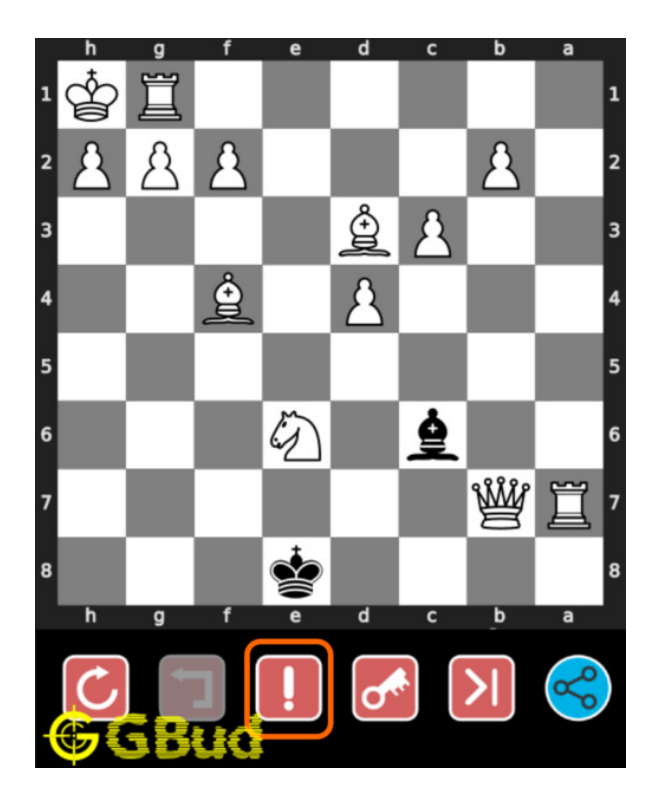
Figure 6: Click the help button to get help on next move @ https://gbud. in/g0rzg41

Access the latest version of this article at https://gbud.in/blog/game/chess/easy-chess-puzzles/easy-chess-puzzle-0043.html