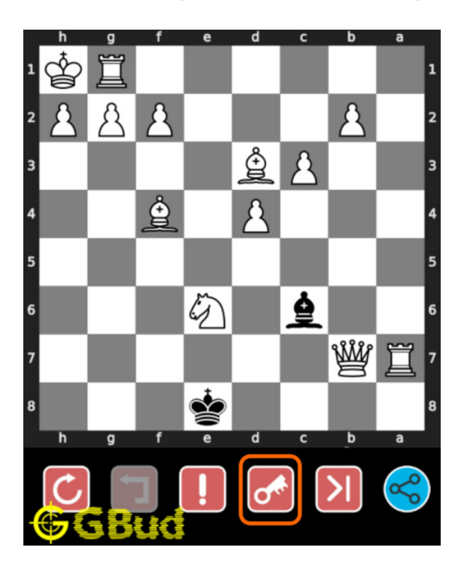
Figure 5: Click the solution button to view solutions @ https://gbud.in/g0rzg41